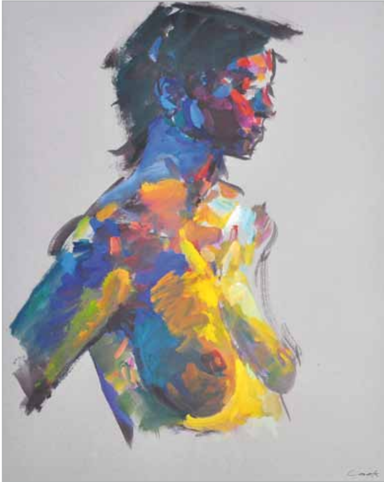
Ian Cook 20" x 16"