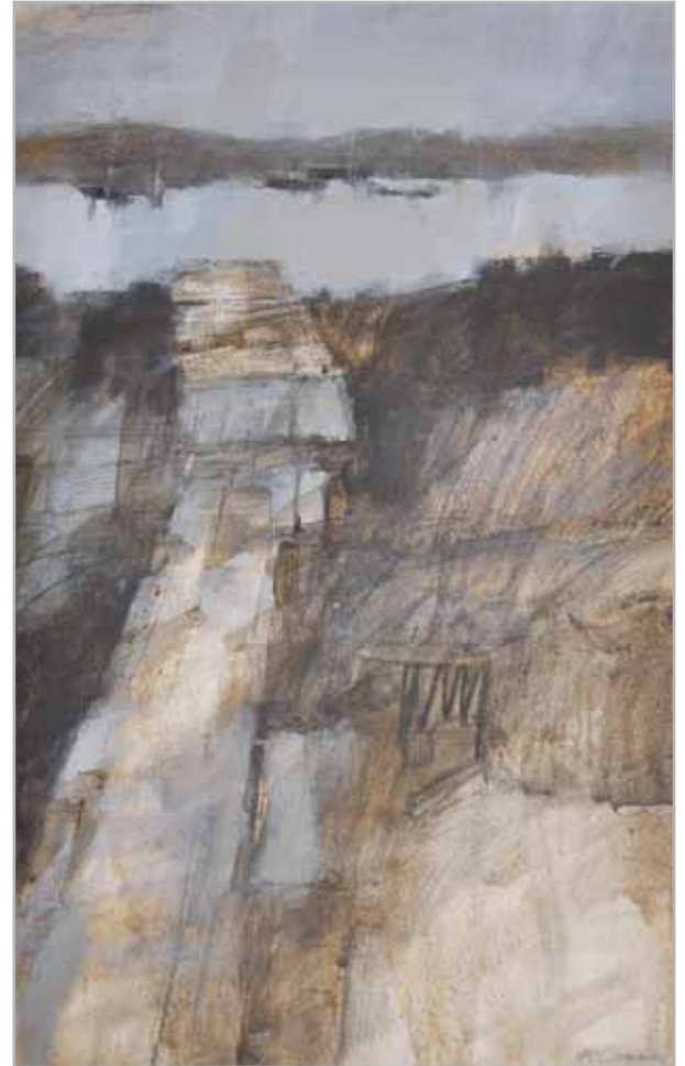
Anne McCormack 21" x 13"

The Russell Gallery is very pleased to welcome 35 of the RI members who are exhibiting their work in acrylic, gouache, mixed media and watercolour for this varied and interesting show.