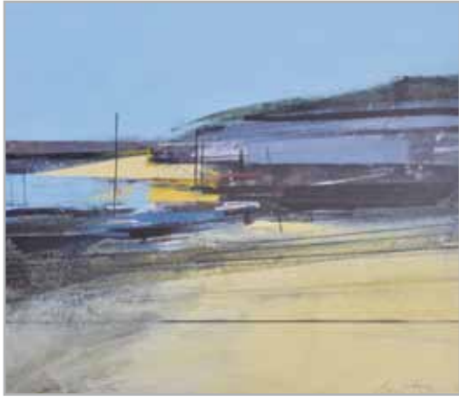
Robin Hazlewood 18" x 21"