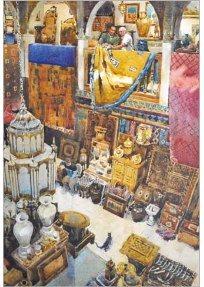
Chris Myers 26" x 18"