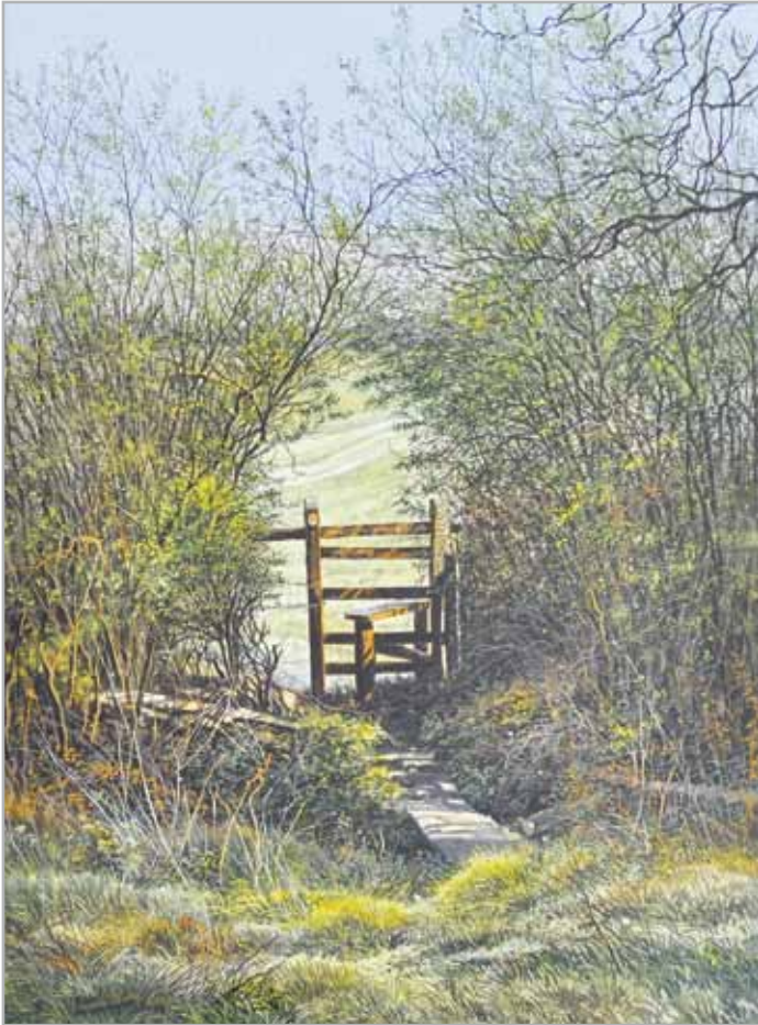
Edward Stamp 16" x 12"