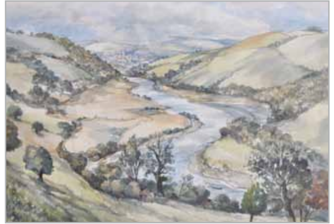
Charles Bone 19" x 27"