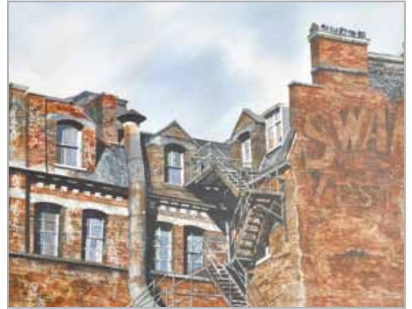
Sandra Walker 16" x 20"