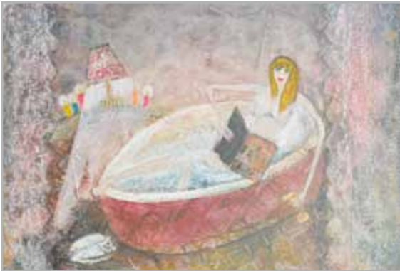
Rosa Sepple 15" x 22"