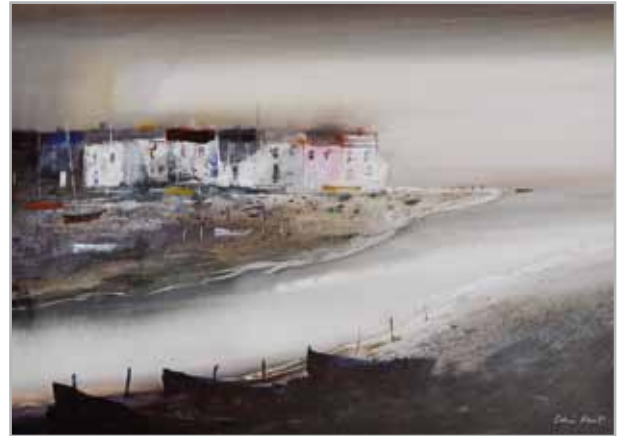
Colin Kent 13" x 18"