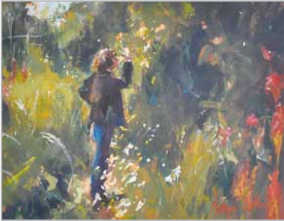
Roger Dellar 8" x 10"